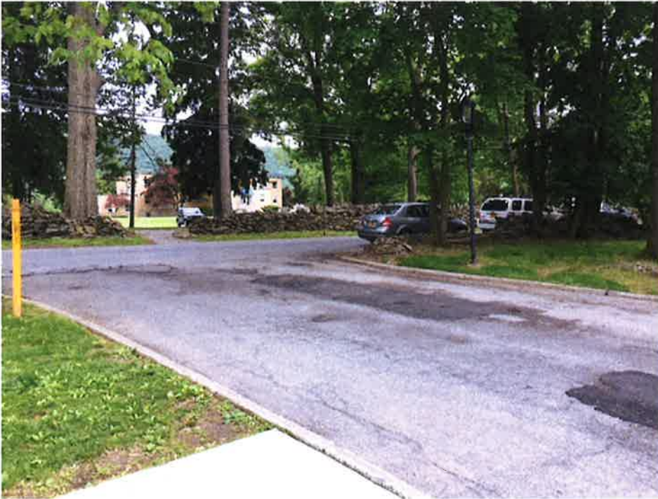
View from Sycamore Drive looking south at Sargent Avenue

The Home Owners Association requested No Parking signs on the north side of Sycamore Drive on Sargent Avenue to a point at the end of the stone wall and on the north side of Sycamore Drive on Sargent Avenue to a point at the end of the stone wall. They say there is a blind spot when cars park there.