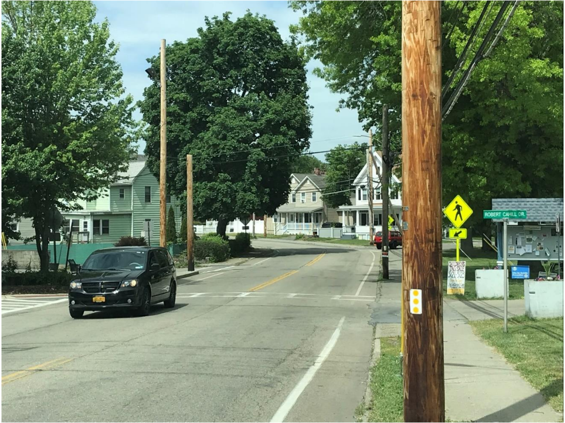
Pedestrian crossing sign at Robert Cahill Dr. on Rt. 52.

May: The Committee recommended the following: