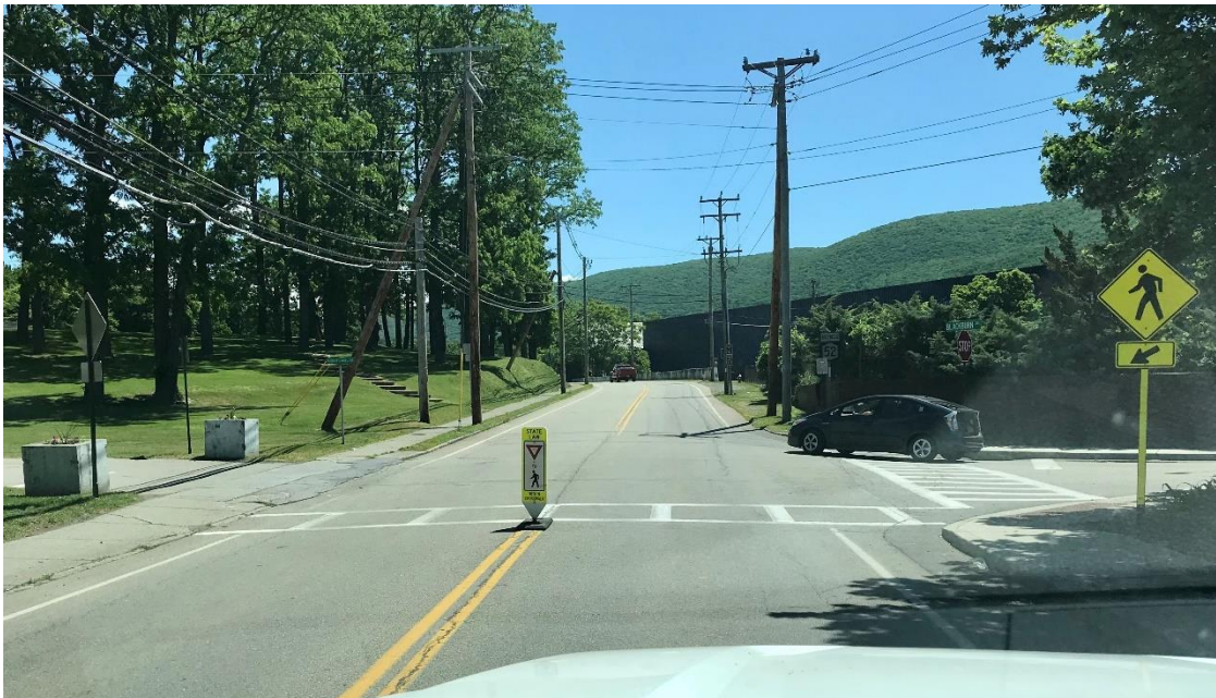
In-Street-Yield Sign (MUTCD R1-6) in the crosswalk on Rt. 52 at Blackburn Avenue/Robert Cahill Dr. Installed on May 27, 2021.