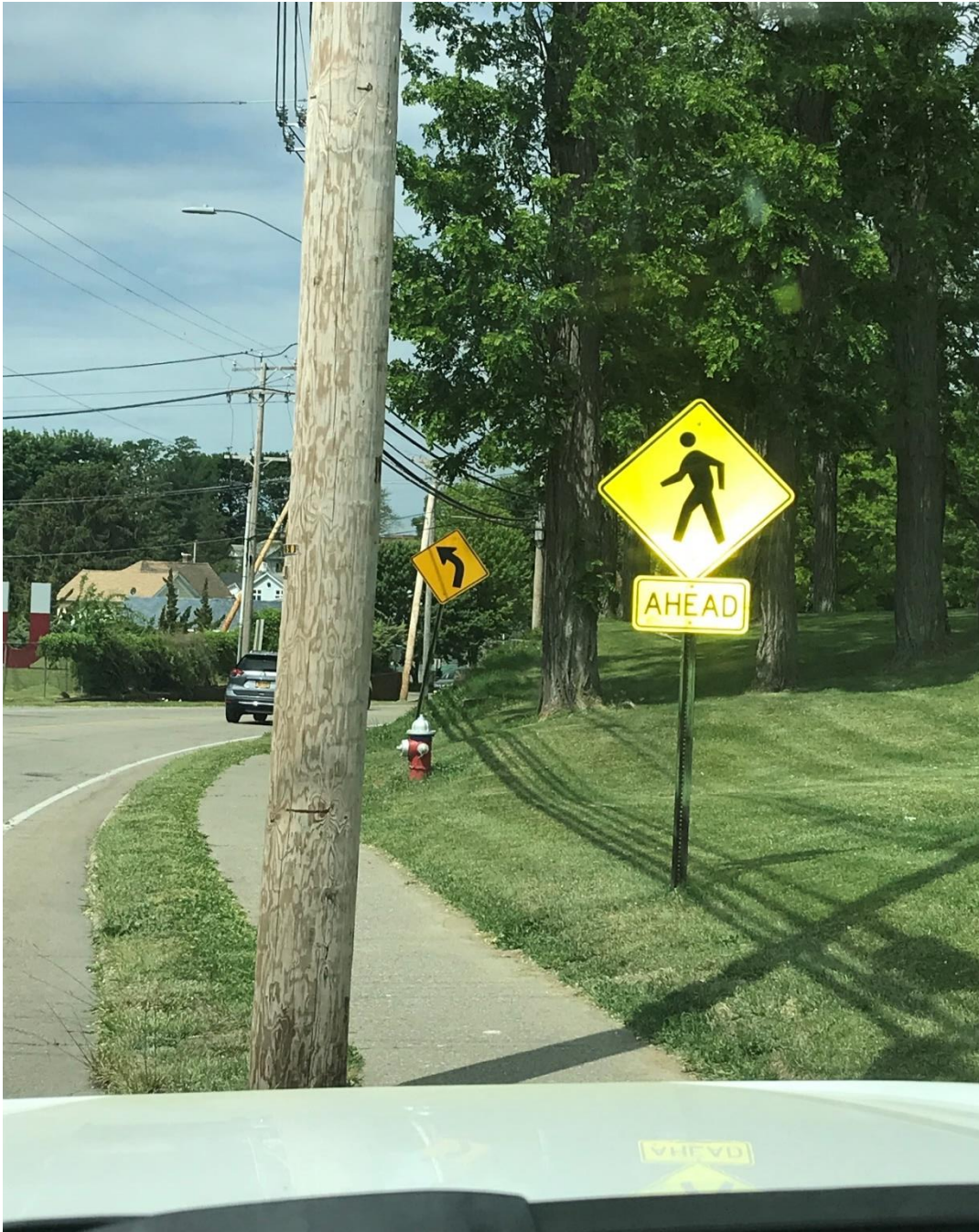
Pedestrian Crossing Ahead sign about 700 feet east of the crosswalk.

Note from Committee Secretary: A petition was started on Change.org to show support for the implementation of a traffic control device(s) at this location. The petition can be found attached to these minutes. The Traffic Committee did review this area in May 2020 and decided to place the following pedestrian crossing signs on Rt. 52.