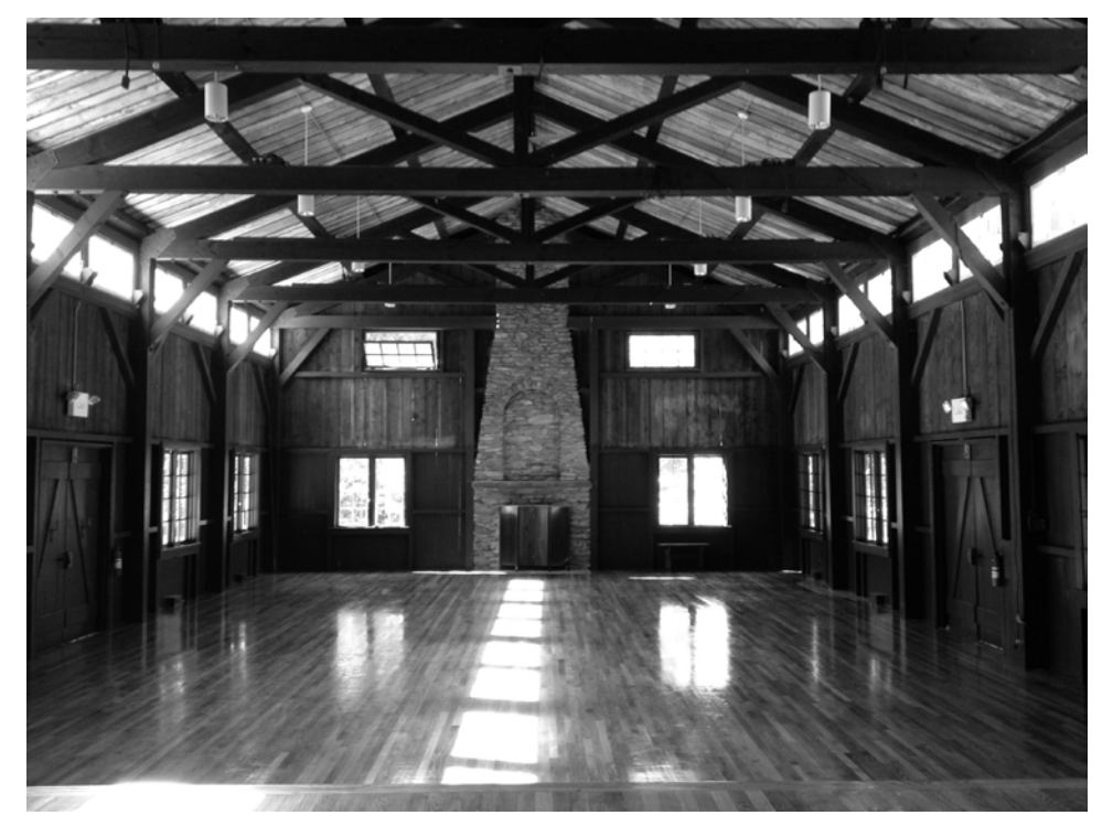
View from stage of main room