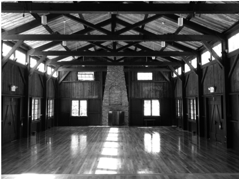
View from stage of main room